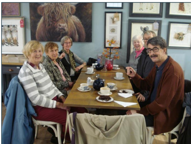
The Garden Centre